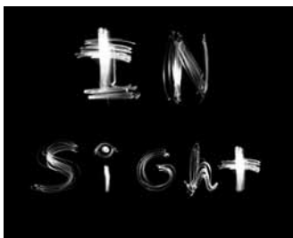
Digital Photo Class

The In-Sight Photography Project 45 Flat Street, Suite 1 Brattleboro, Vermont 05301 www.insight-photography.org